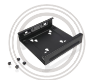
ThinkCentre Tiny VESA Mount II