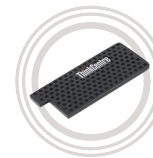
ThinkCentre Tiny IV 1L Dust Shield