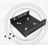
ThinkCentre Tiny VESA Mount II